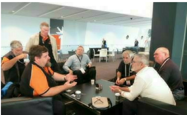
Members of the SESVAs of WA and NSW discussing a future National SESVA - Perth AFAC 2012