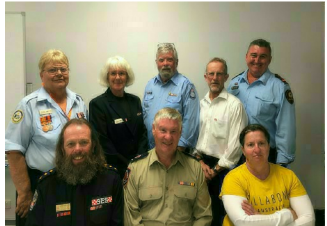
Board of Directors May 2019